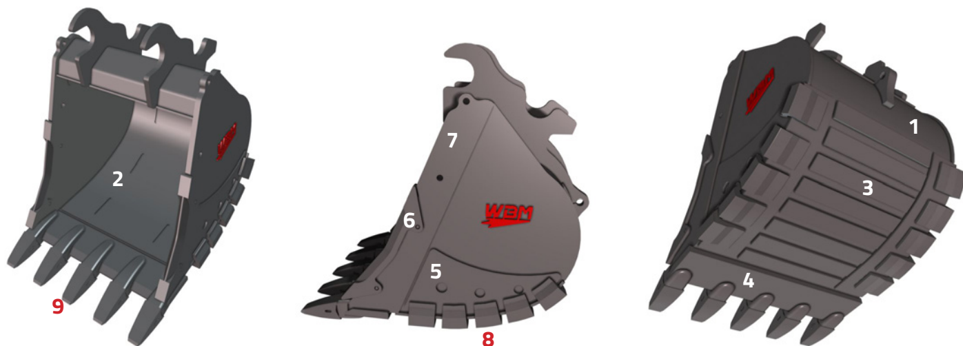
Extreme Service Rock Bucket shown above.